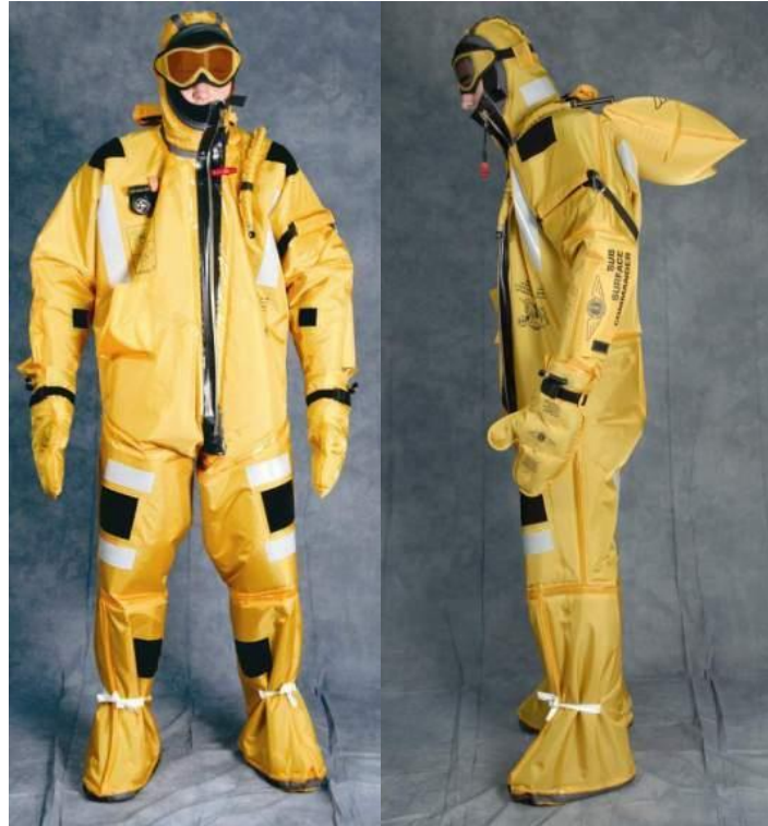
Submarine Surface Abandonment Suit