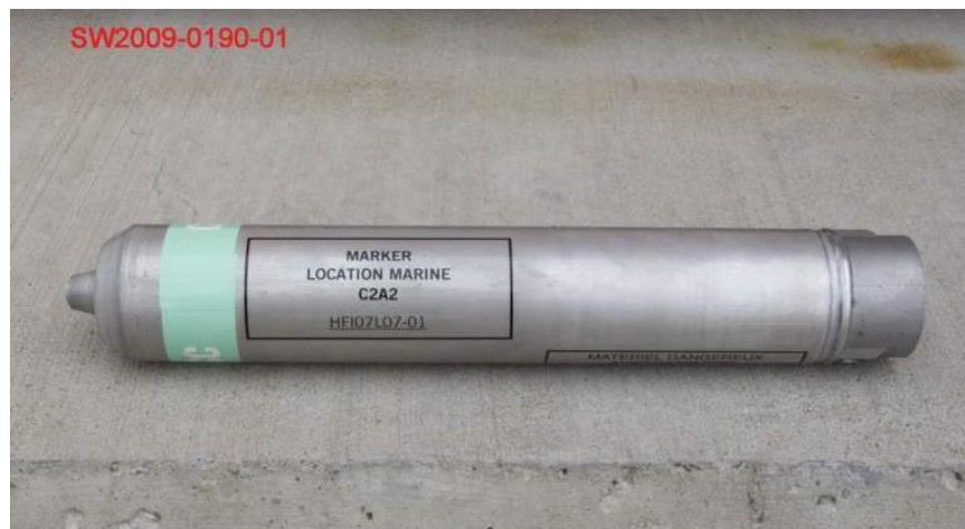
Marine Location Marker C2A2

Authority: Department of National Defence (NDHQ)