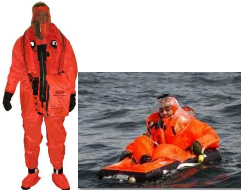
Mk10 Submarine Escape Suit with MK 18 Single Individual Life Raft