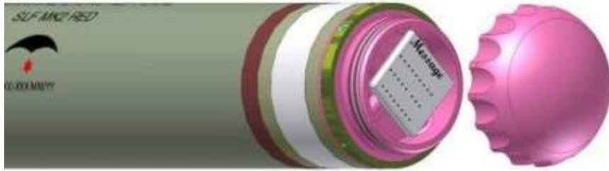
Message Carrier Area of Nose Assembly SLF MK2