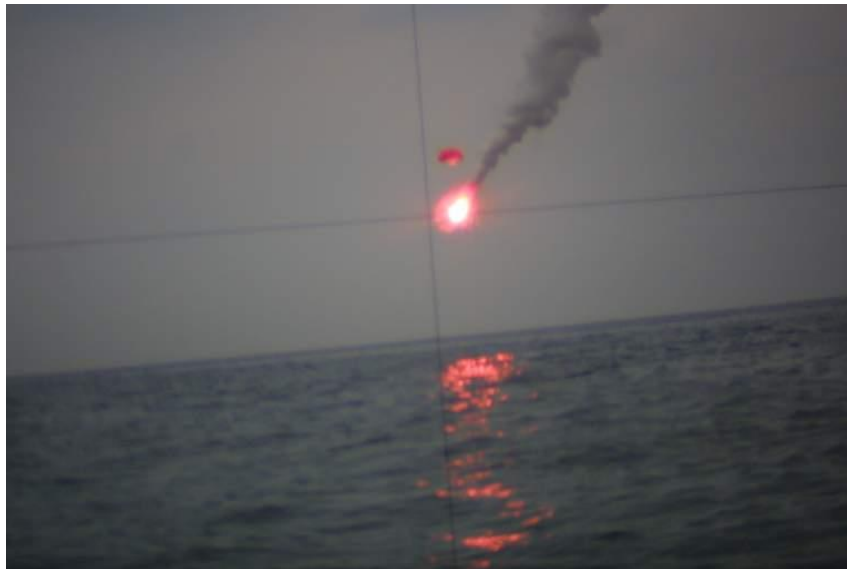
Submarine Launched Red Para Flare deployed