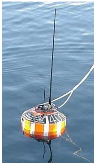
639 Indicator Buoy

Each Canadian submarine has two buoys which are fitted with an automatic transmitting radio unit operating on 243.0 MHz, and the Global Maritime Distress and Safety System (GMDSS) frequency 406.025 MHz. The signals are transmitted automatically when the indicator buoy is released. On frequency 243 MHz, the sound is a high-pitched tone dropping to a low-pitched tone, then a break. This is repeated and these repeating tones will trigger automatic receiving SAR equipment. On the GMDSS frequency, a 15-digit code is transmitted in digitalized format. This code is received by satellite, which will correspond to the specific indicator buoy. The code is identified by the Rescue Coordination Centres. Ships hearing these signals should immediately report their position and depth of water and, if possible, an indication of signal strength. If such a buoy is sighted in depths of water greater than 1000 m, it is certain to be adrift, and this fact should also be reported as soon as possible.